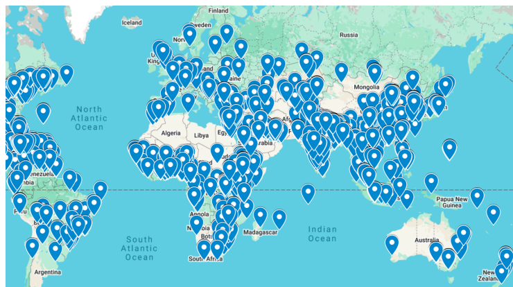
Worldwide impact: Reached students in 182 countries in 2025-2026